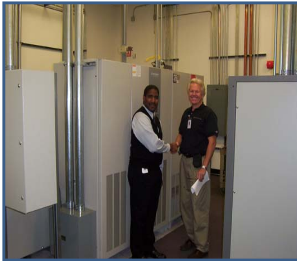
Successful commissioning of a fast track TurnKey 225KVA UPS & battery installation for a major Orange County CA Data Center. Project was completed on budget and well ahead of schedule. The client survived an outage the weekend it installed!