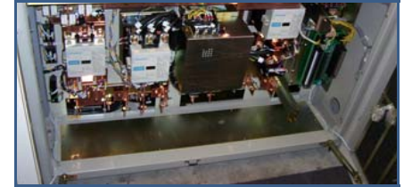
Low THD, High MTBF IGBT Design with Active Rectification.