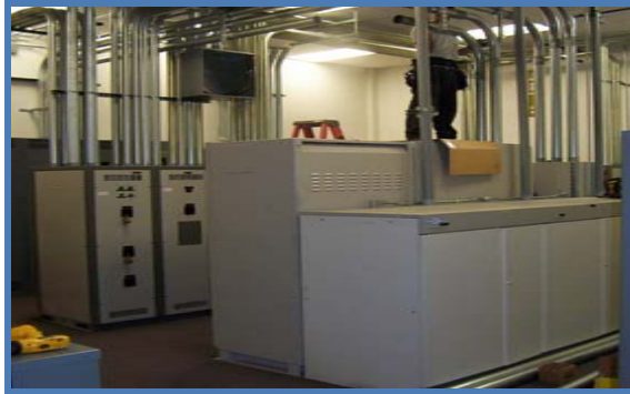
Design-Build 600 KVA UPS / battery replacement project in So California.

County, Pacific Bell, and dozens of Fortune 500 firms. The projects have typically been highly technical and required complete understanding of both client needs and the manufacturer technical advantages. For specific project references & testimonials, go to www.mcwestinc.com/clients .